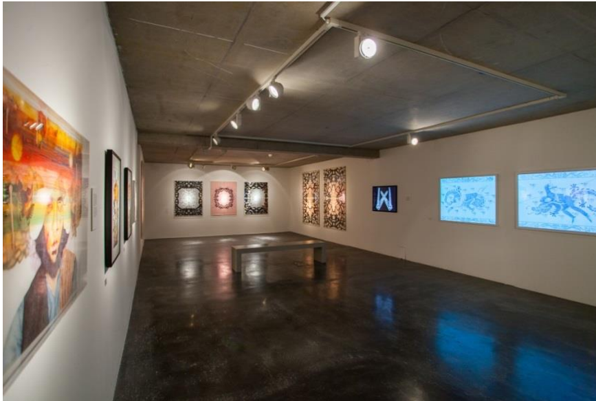
The Mezzanine Gallery