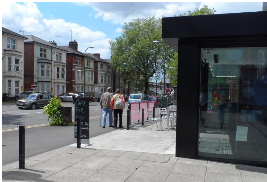
External frontage paving to NAE Entrance