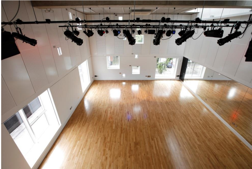
The Performance Space