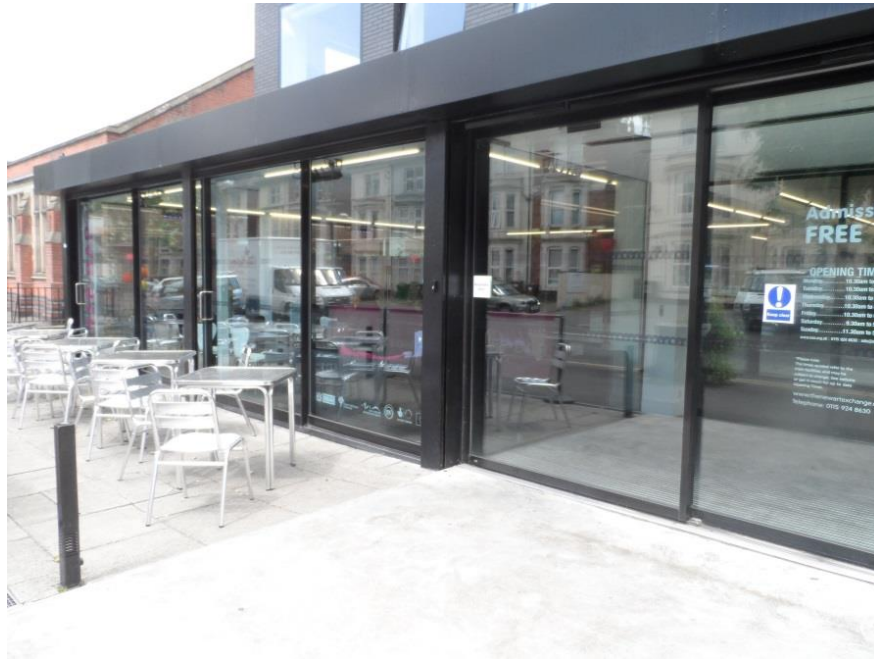
Main Entrance with Automatic Doors